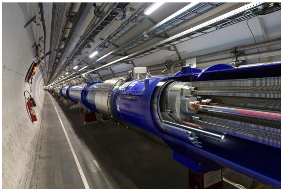
Figure 1: Inside the huge circular tunnel of the LHC

Currently, there are over 50 000 particle accelerators around the world. [1] Many of them are used in hospitals for cancer treatment, but they also find applications in manufacturing, security, and research. The world's largest accelerator is the Large Hadron Collider (LHC), near Geneva (Switzerland), which is a circular machine with a circumference of 27 km (figure 1). [2]