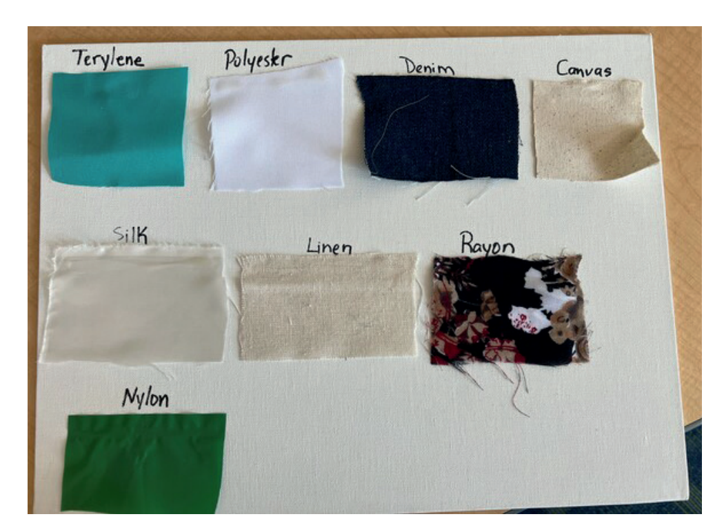
Various types of fabric materials

Students explore the properties of different fabrics. In these tests, each fabric is tested for durability and resistance. Comparing and contrasting the quality of materials will determine if the fabric material selection meets the requirements for the parachute design. Both activities in this lesson can be completed within a 60-minute time frame, including discussion time. This lesson is appropriate for 11- and 12-year-old students studying chemistry. Students should work in groups of four or five.