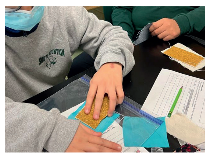
Students checking the durability of the fabric material. Here, sand paper is applied to the fabric, but wrapping the fabric around a ball and rubbing it against the sandpaper works better.