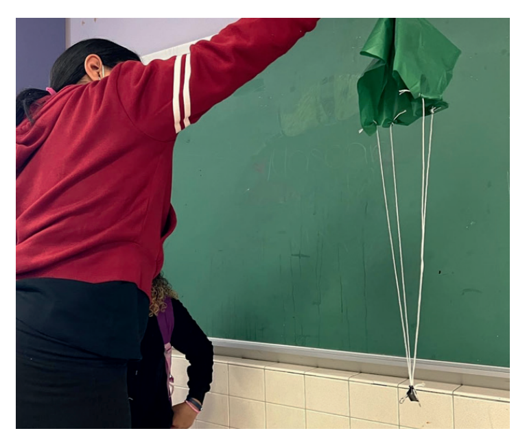
Students testing air resistance