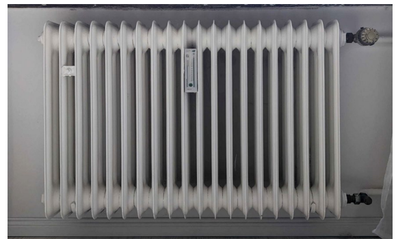
Left: Lamellae (2017). Right: a radiator