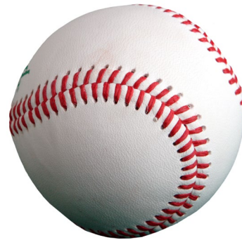
Left: chitin (2020). Right: a baseball