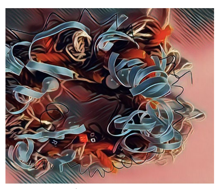
The blood protein

TGS implemented the project broadly, with students aged 12 to 17 years participating at various levels. Dedicated lessons introduced students to molecular structures in the PDB and the basic scientific concepts of proteins and amino acids, using resources provided by PDBe, 3D modelling kits, and activities. Later, the students were reintroduced to molecular structures in art lessons using additional resources from PDBe like a 3D visualisation tool and previous year's artworks in the PDBe calendar. The students were then encouraged to research a protein of their choice before creating artworks depicting the protein and written descriptions about how their artwork relates to the protein and the world around us. For large groups of students, this structured approach works well, however, it does limit the potential for the students to really explore the science further. For older and more advanced students, TGS ran a more free-form version of the project, with more focus on independent learning outside of lessons and during extracurricular sessions. This allowed students more time to explore and research the scientific topics, thus resulting in deeper interpretations of proteins in their final artworks.