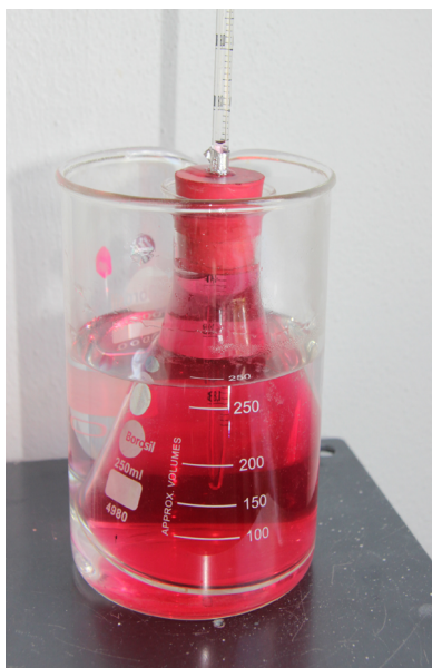
Experimental setup to demonstrate thermal expansion of water.

Immerse the flask inside a large container like a 500 cm 3 beaker containing hot water, allow the water inside the flask to warm up until the expansion stops (this takes several minutes) and then ask students to make a note of the water level.