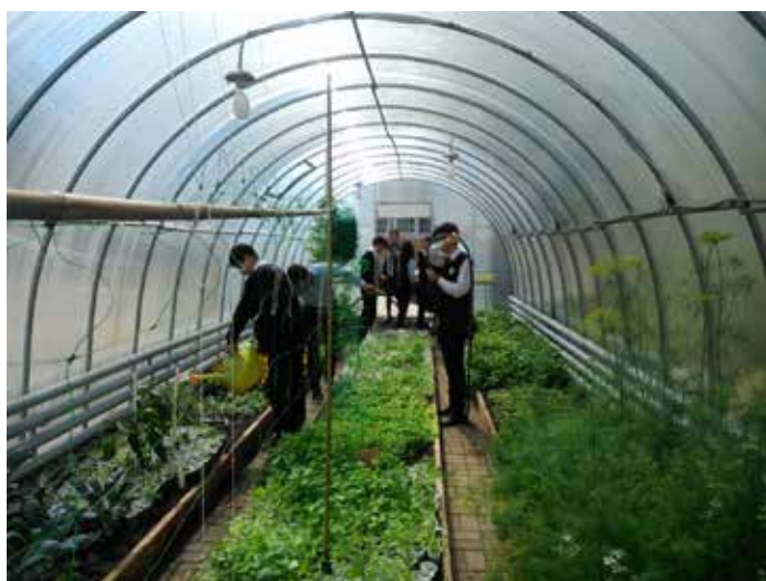
Students at work in the greenhouse

For some definitions of statistical terms, please see the text box (or use standard sources).