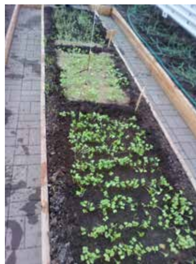
Soil plots: the enriched plots (top) are lighter in colour than the normal plots (bottom).

Most students like to see plants grow, so the horticulture experiment is a worthwhile activity in itself. Kazakhstan has a continental climate, with very hot summers and extremely cold winters, so to grow plants in the spring we used a heated greenhouse. Of course, the plants can also be grown outdoors if the season and climate are suitable.