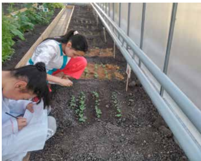
Students recording radish data from the different soil plots

At the end of the growing period, calculate the mean (average) length of these leaves for each plot over the whole growing period. This is calculated by adding together all the measurements for that plot, and then dividing the result by the number of measurements.