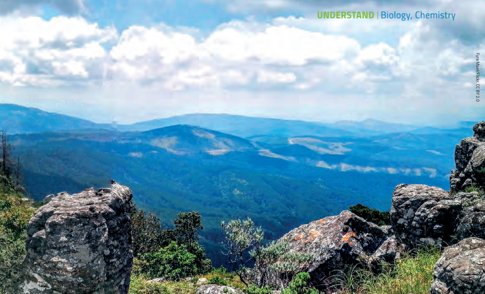
Westall's team examined volcanic sediments ranging from 3.46 to 3.33 billion years in age from the Barberton Greenstone Belt in South Africa (pictured here) and the Pilbara in Australia.