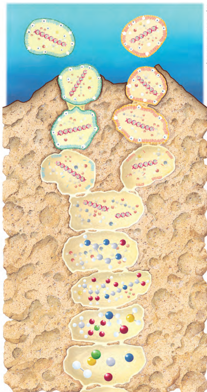
Artwork illustrating the theory that life on Earth originated around underwater volcanic vents. Nine stages are shown, from the atomic level to the cellular level. From bottom: prebiotic chemistry; amino acids, sugars and bases; more complex carbon compounds; formation of RNA; formation of DNA. The evolutionary tree splits at this point into the routes that will form bacteria (left) and archaea (right).

luck at the same time. Her view is that the reactions responsible would have happened on the surfaces of minerals. Chemists in her group talk about a ‘protocell’, with metabolic machinery and RNA contained in a tiny mineral pocket. Eventually, fatty lipid molecules would have formed an outer wall inside the pocket, giving cells the