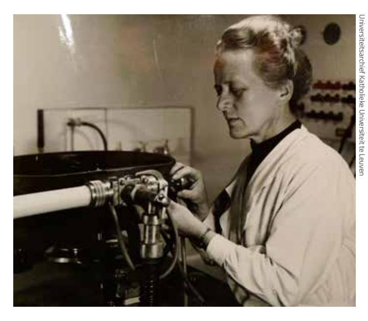
Ida Noddack-Tacke adjusting an X-ray spectrometer in the laboratory, 1944

weights, but the need for a precise atomic weight required the substances to be prepared in their purest state. This task involved repeating precise analytical procedures, and such work was often left to 'foot soldiers' like Lermontova. The contributions of this shadow army of chemists - many of them women - who were required to provide pure elements or precise atomic weights are often forgotten, but they show the real challenges met by Mendeleev and his contemporaries to organise all known elements into a meaningful system. Lermontova's unpublished work remained unknown to historians for a long time, but it was rediscovered in Mendeleev's archives almost 100 years later.