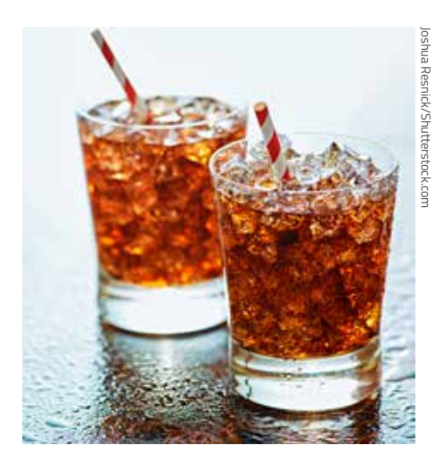
Cola and other fizzy drinks often contain highfructose corn syrup made using thermophile enzymes.

Taq, this was a laborious and expensive procedure that involved repeated cycles of heating and cooling, with fresh enzyme (a polymerase that denatured on heating) added at each cooling stage. Using Taq, the process is automated and runs at a high temperature, with only a small amount of the enzyme required. In a matter of hours, Taq-based PCR can turn a single DNA molecule into 100 billion copies, and a tiny sample of body fluid from a crime scene can thus yield enough genetic material to create a DNA fingerprint.