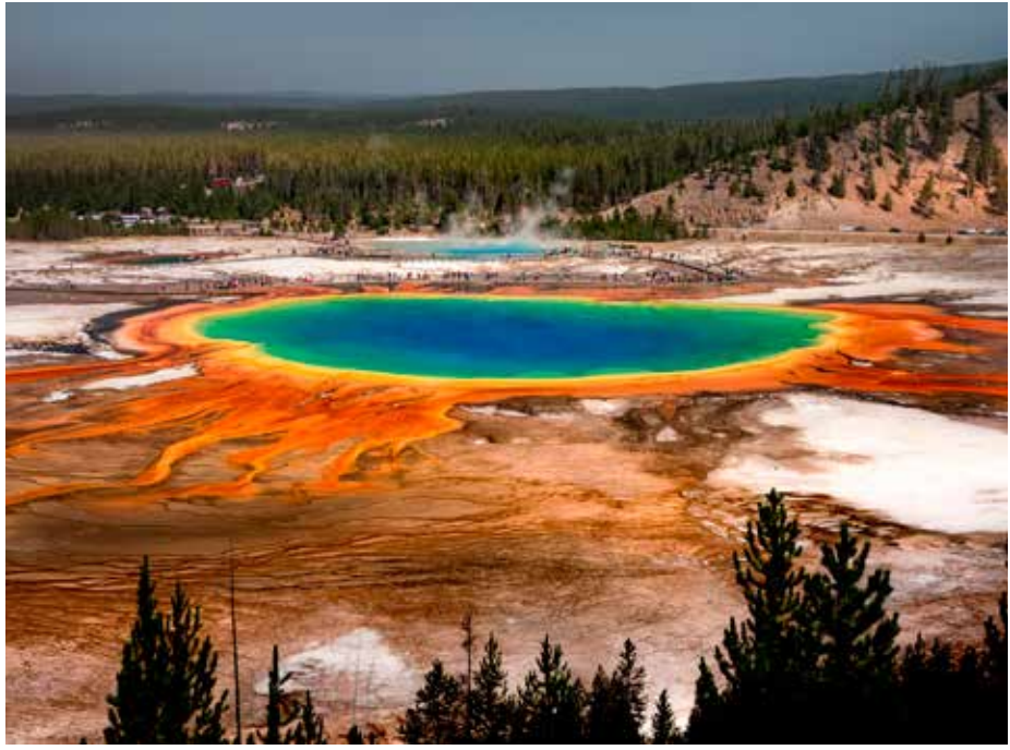
Grand Prismatic Spring in Yellowstone Park, USA. The colours are due to microbial mats formed by thermophiles.

Another interesting feature of geothermal sites such as hot springs is that there is often a sharp temperature gradient: deeper underwater zones are hotter, while those towards the pool's edge are cooler. Different thermophiles find a comfortable niche at different points along the gradient. Thermophiles that can photosynthesise, such as cyanobacteria, live at the cooler end of the gradient, while less brightly coloured types are restricted to the thermal extremes. The result is a multicoloured 'microbial mat' carpeting the rock, with each zone of colour representing the distinct biochemistry of the organisms present, from the yellow-green colours of those that photosynthesise to the diverse shades of those that obtain energy by metabolising hydrogen, iron or sulfur compounds. A famous example of