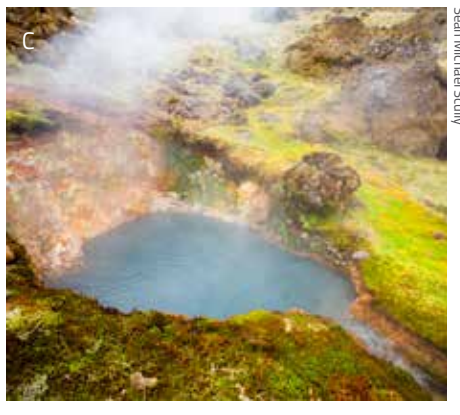
Volcanically heated water provides ideal conditions for thermophiles in Iceland's many geothermal hot spots. The colours are caused by iron and sulfur compounds. A: a boiling mud pit at Námaskarð; B: a hot intertidal pool near Húsavík; C: a hot spring at Grensdalur

A fumerole (volcanic vent) at Námaskarð, Iceland