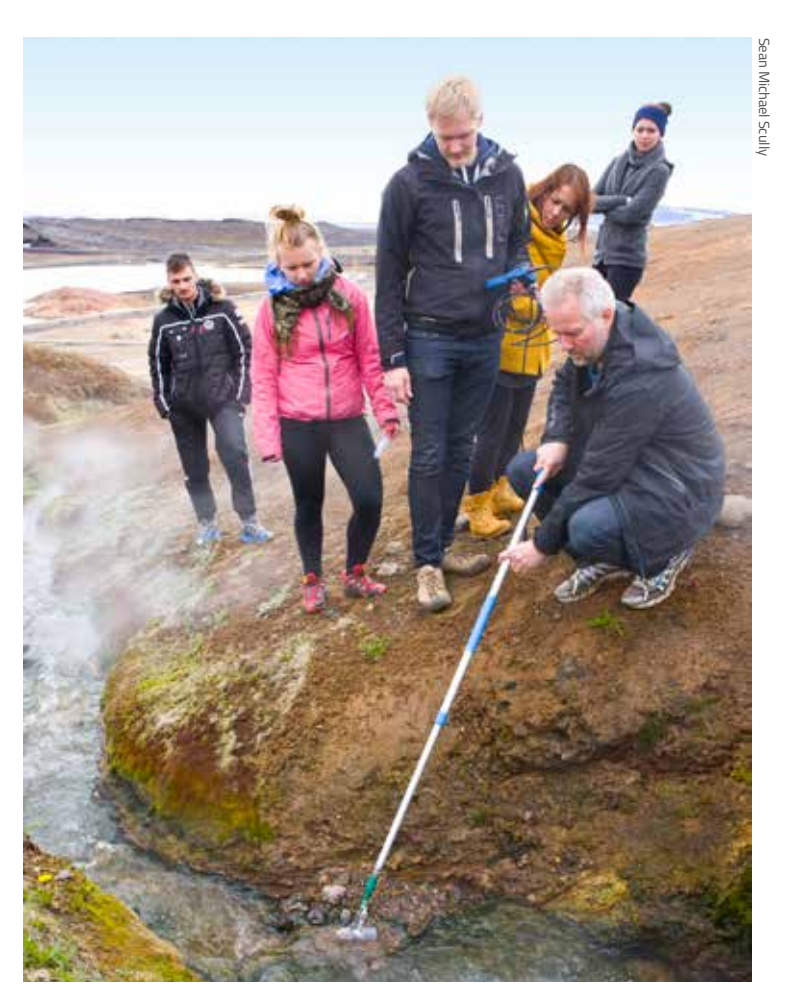
A researcher samples some high temperature (80 °C) geothermal fluid near Myvatn (northern lceland), using a sampling pole as students watch.

"One challenge is to find a thermophile that can tolerate high levels of ethanol without being poisoned."