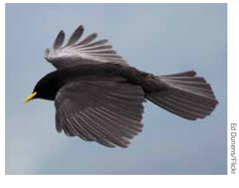
Modern bird species, showing some of their amazing variety. Top left: Atlantic puffin (Fratercula arctica); top right: kingfisher (Alcedo atthis); bottom left: white stork (Ciconia ciconia); bottom right: Alpine chough (Pyrrhocorax graculus)

genetic changes that we can observe within a species (sometimes called 'microevolution'). Unfortunately, this dichotomy suggests that there are two different types of evolution, or that evolution is driven by different mechanisms on the 'micro' and 'macro' levels. This distinction is often exploited by those who do not accept evolution, and who claim that only 'microevolution' ever occurs. But the