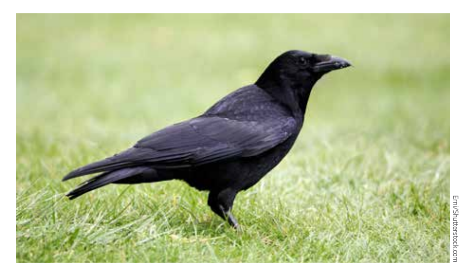
The carrion crow, Corvus corone corone