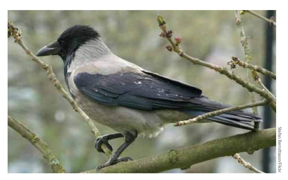
The hooded crow, Corvus corone cornix

glaciers melted around 10 000 years ago, populations of species that had been separated for a long time came into contact again, as they were able to move out of their refuges and repopulate the continent. But spending many thousands of years apart meant that the different populations acquired some genetic variants peculiar to each, which made it harder for the populations to interbreed when they came back together.