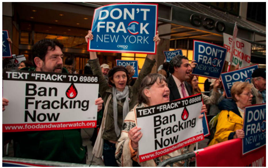
Anti-fracking demonstration in New York, USA (October 2012)

Shale deposits are located all over the world, but the shales that contain the most gas formed in marine environments, particularly in slowmoving, poorly oxygenated water such as ancient sea basins. Here, the plants and animals could not decay before they were buried, providing organic material that was later converted into fossil fuel.