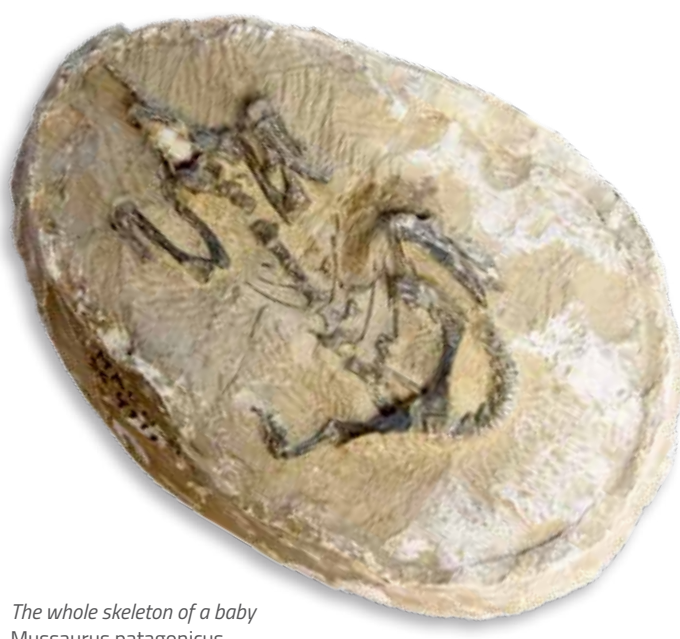
The whole skeleton of a baby Mussaurus patagonicus, roughly 1 month old