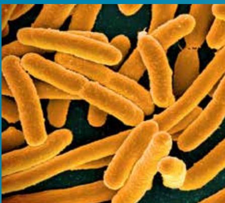
Escherichia coli ( E. coli )