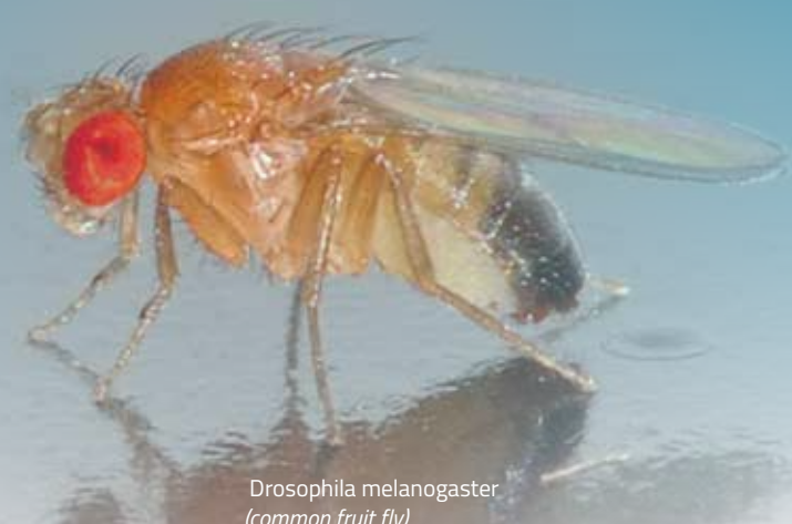
Drosophila melanogaster ( common fruit fly )