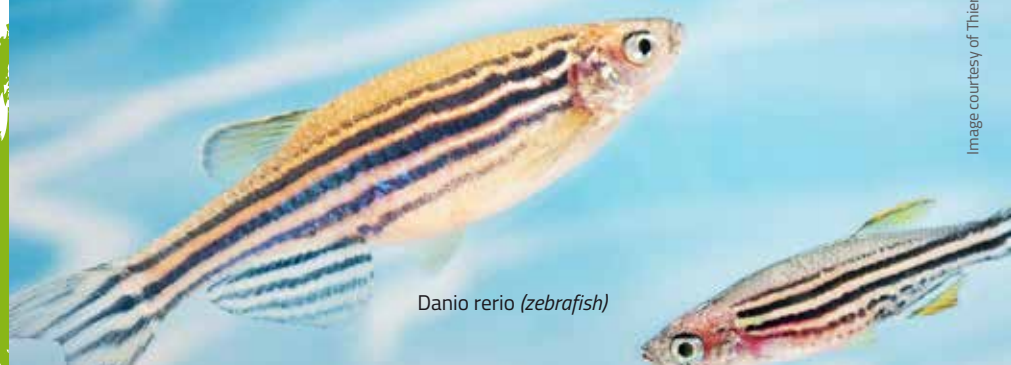
Danio rerio (zebrafish)