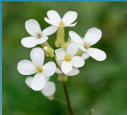
Arabidopsis thaliana ( thale cress )