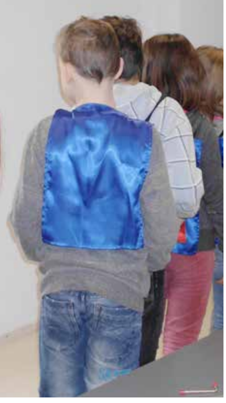
Figure 3: Modelling the internal structure of a magnet: after 'magnetisation', all the pupils face the same way – like the dipoles in a magnet.