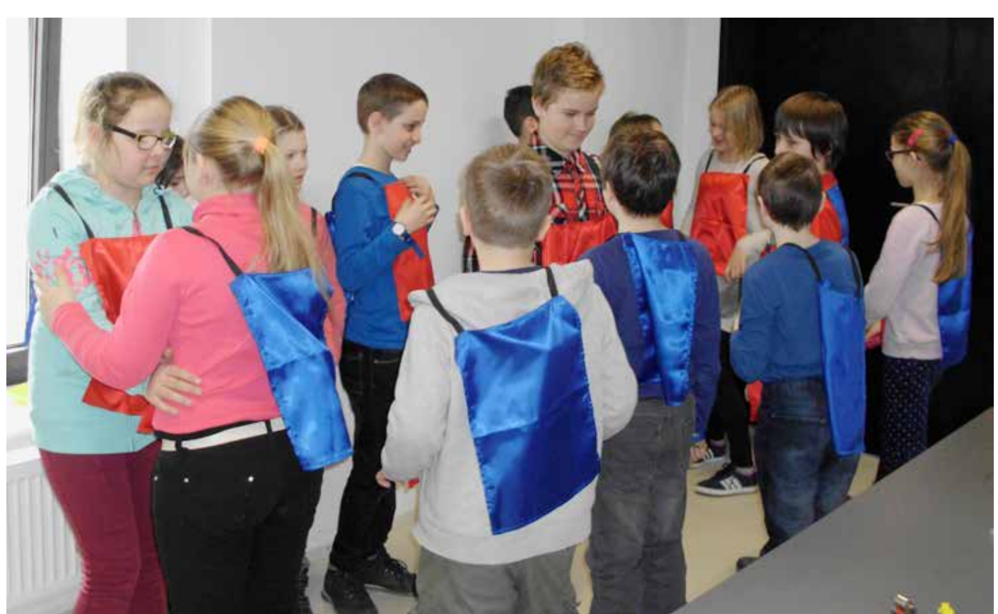
Figure 2: A material before magnetisation: pupils face different directions

use squares of red and blue paper pinned onto the pupils' normal shirts.