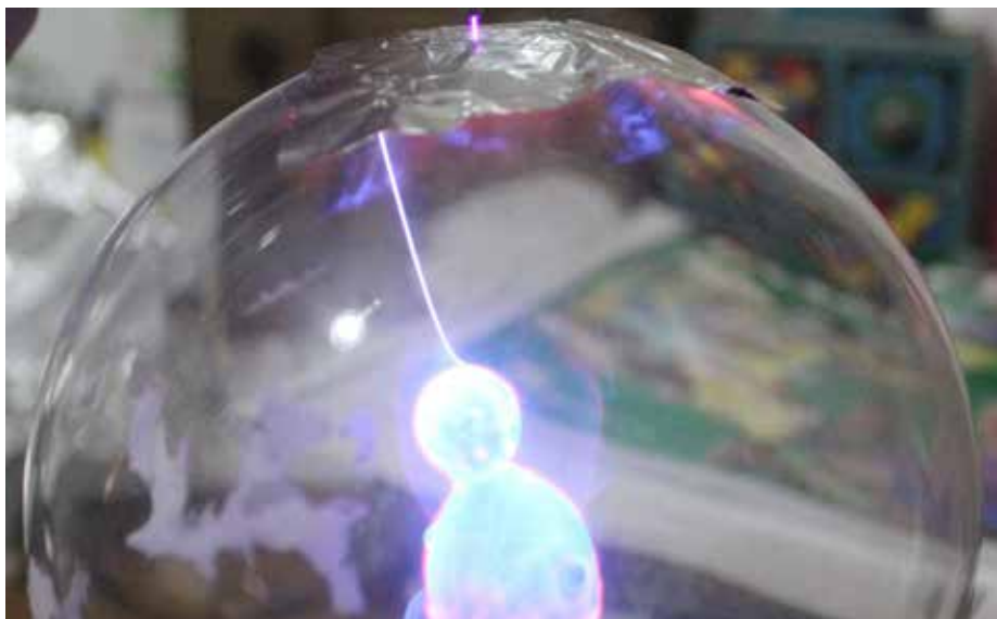
We can see how the electricity goes beyond the limits of the plasma globe