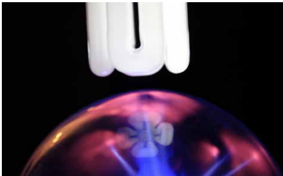
A fluorescent bulb glows without touching the plasma globe.