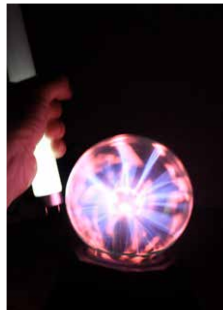
The hand makes a border. There is no light behind it.

energy level, emitting UV radiation when they fall back to their normal level. Because this excitation requires a specific minimum amount of energy to happen, the bulb needs to be within a specific distance of the globe. The UV radiation is invisible to the human eye, but it is absorbed by the bulb's fluorescent coating and re-emitted at a lower energy, which we see as the bulb's glowing white light.