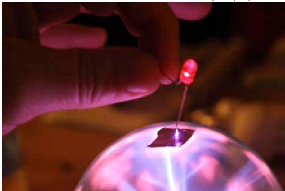
The spark lights an LED.

energy and so will not light up under these conditions.