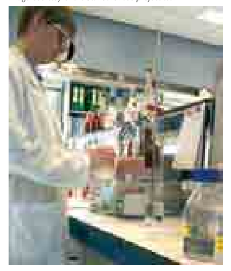
Titration in a Dutch laboratory