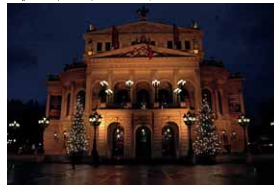
The Old Opera House in Frankfurt, Germany