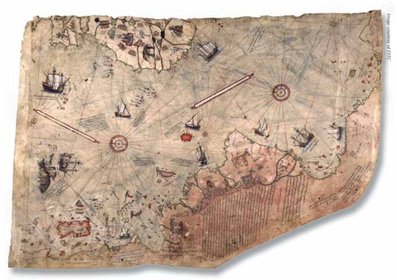
The oldest surviving map of the Americas, by Piri Reis, 1513 CE

of St Paul's Cathedral in London, UK, and in the horseshoe arches and gothic ribs of Al-Hambra in Granada, Spain.