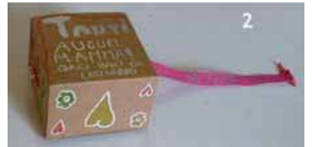
A gadget for mother

See page 23 for a construction plan of the tape contraption.