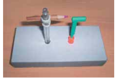
The finished tape contraption