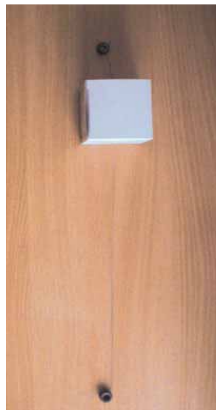
The contraption in operation

When both threads are pulled, the box moves upwards and towards the thread that is rolled around the small-