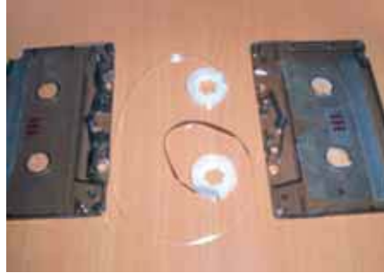
Reattach the tape to the wheel