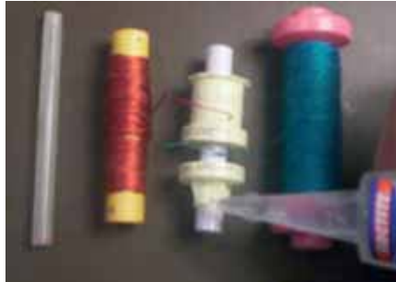
Attaching the thread