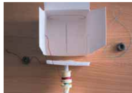
Assembling the contraption