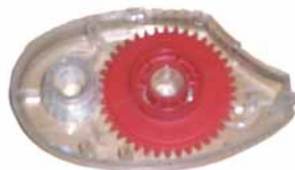
Corrector pen roller

used, such as the rollers found in corrector pens.