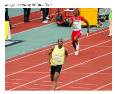
Usain Bolt at the Bolt Crystal Grand Prix in 2009

After any race, the competitors evaluate their performance and begin to plan for the next challenge. The organisers have already set the date for the