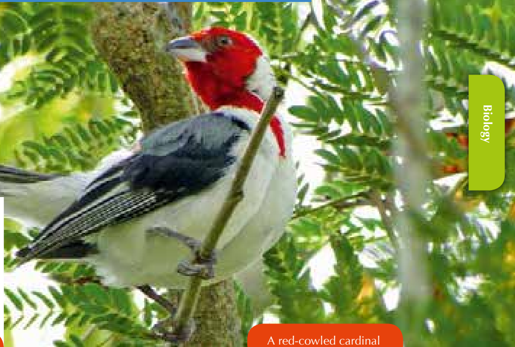
A red-cowled cardinal