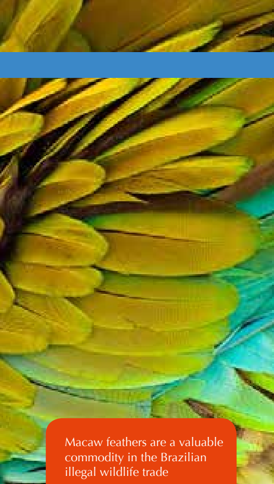
Macaw feathers are a valuable commodity in the Brazilian illegal wildlife trade