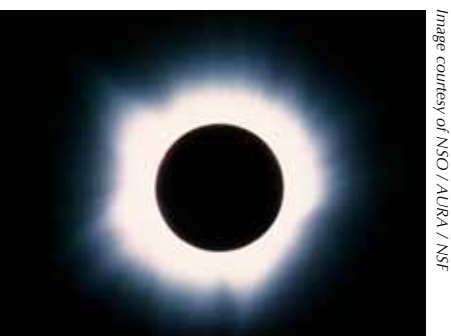
The delicately structured glow of the solar corona, as seen during the total eclipse of the Sun on 7 March 1970. The corona is visible to the naked eye only during an eclipse

Ask your students if they have ever seen an eclipse. Was it a solar or a lunar eclipse<sup>w4</sup>? Explain that solar eclipses are much rarer but