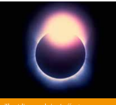
The 'diamond ring' effect occurs when only a tiny sliver of the Sun is visible around the Moon during a total solar eclipse

Three-quarter solar eclipse observed at the Kitt Peak Vacuum Telescope on 10 June 2002