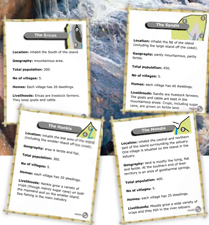
Moja Island community cards