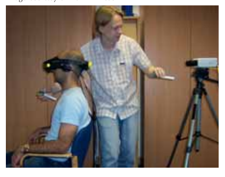
Inducing an out-of-body experience