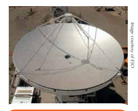
The European antenna prototype for ALMA

length to be detected by ALMA's antennas means that although they are accurate to much less than the thickness of a single sheet of paper, the dishes do not need the mirror finish used for visible-light telescopes. So although ALMA's dishes look like giant metallic satellite dishes, to a (sub)millimetre-wavelength photon, they are still almost perfectly smooth reflecting surfaces, focusing the photons with great precision.