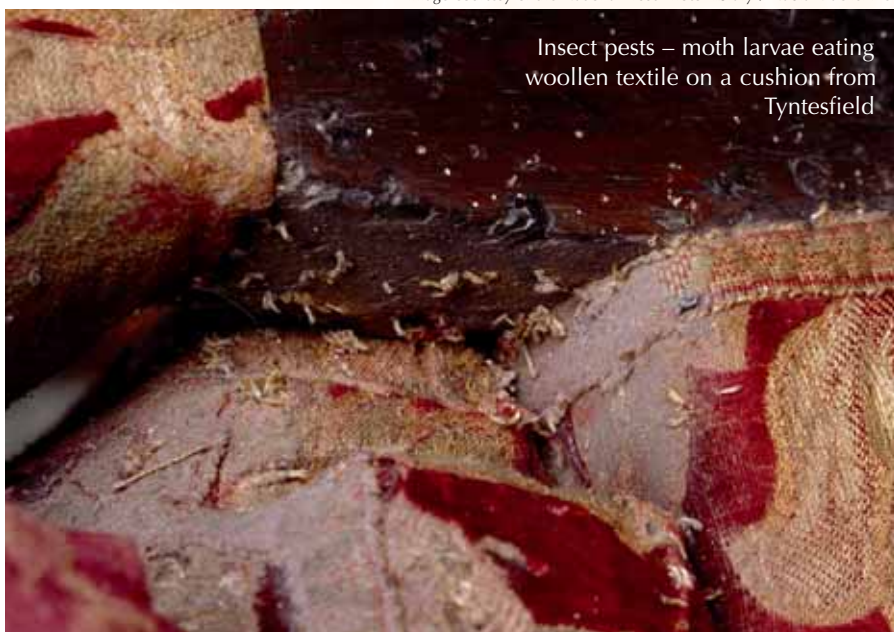
Insect pests – moth larvae eating woollen textile on a cushion from Tyntesfield