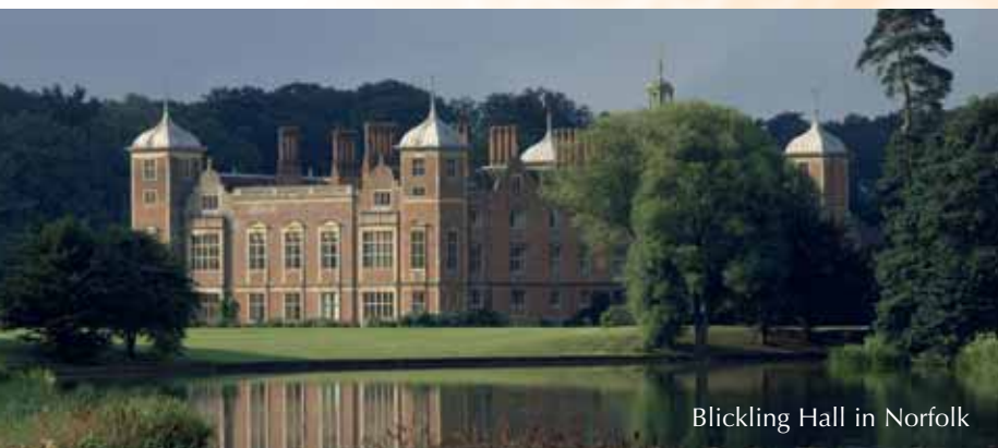
Blickling Hall in Norfolk