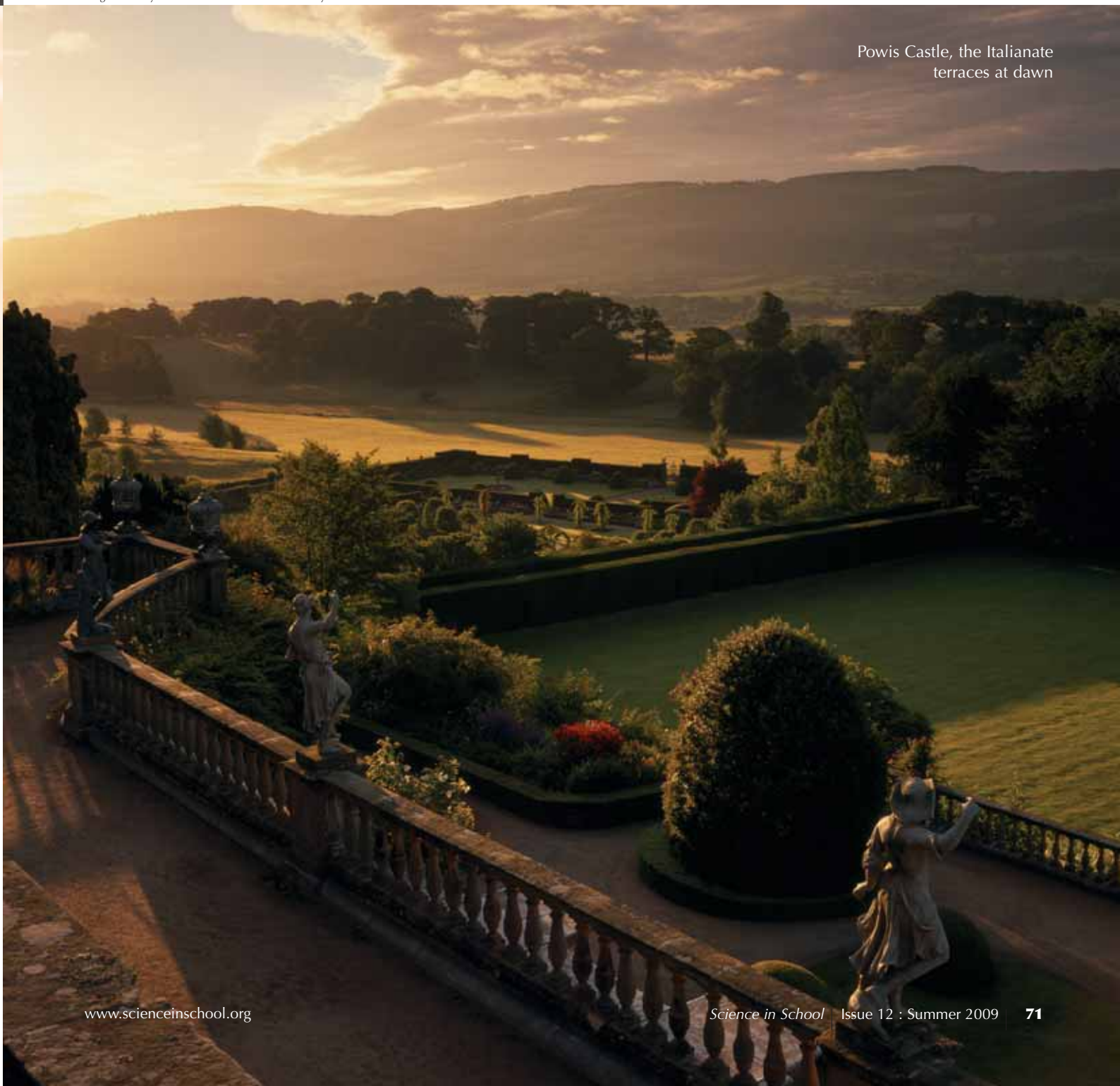
Powis Castle, the Italianate terraces at dawn