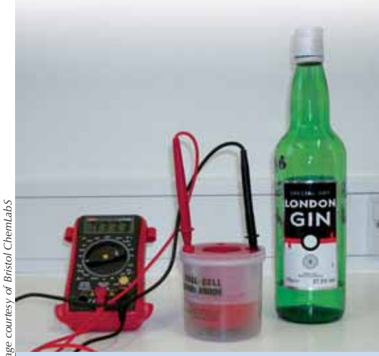
Electricity generated from gin in a mini fuel cell

Both the previous experiments are based on the release of energy through combustion. While this is one way of oxidising a fuel to release energy, it is