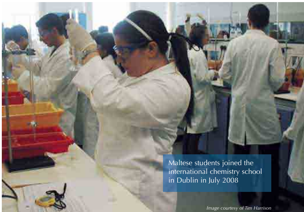
Maltese students joined the international chemistry school in Dublin in July 2008

The next Belgian Science on Stage event will take place on 28 January 2009 in Jemeppe-sur-Sambre, Belgium. See the Belgian Science on Stage website w3 for details.