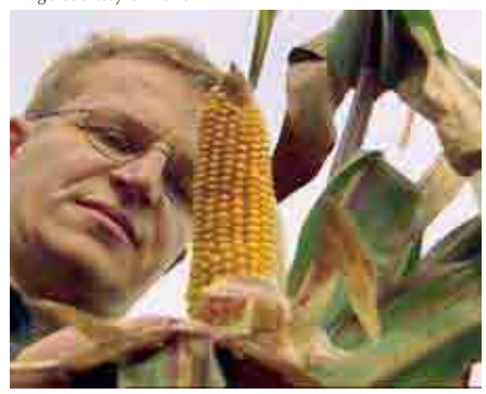
Inspecting GM sweetcorn, an excerpt from a Nano broadcast

to do about every three or four weeks, can look very boring from the outside. First you have the research phase, where you sit at your desk, search for information on the web, phone people and put things together. You find a topic, try to get a picture of the details involved, write a script, prepare and organise everything. You have to find the right people, the locations, and so on.