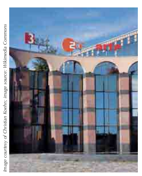
The broadcasting center in Mainz

"There is something I would like to tell all young people: never let anyone discourage you from something you really want. Be brave and do not be afraid to take a side road in life or start something new. You will always learn something, for example 'soft'