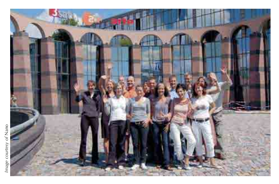
The Nano team in front of the broadcasting center in Mainz

from another department will turn up who also has a great idea for TV you really need to have huge ears and eyes to communicate with everyone. And of course you have to keep an eye on the work of the camera team. You have to fulfil everyone's need for information, without forgetting to check everything is done correctly and on schedule. You also have to be a bit of a psychologist, to put people at ease who may be shy in front of the camera, or to tell a worried doctor you will cut out embarrassing things he may have said or done. Although it looks as if the cameraman is doing all the work, it can actually be quite exhausting for the reporter, too. And then there are of course the days when nothing works - the train is late, the doctor is ill, the cameraman is in a bad mood - so you need to have some talent for improvisation, too.