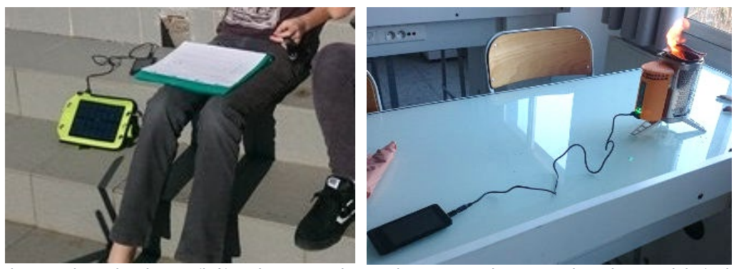
Charging a phone with a solar charger (left) and a BioLite charger that uses combustion and a Peltier module (right).

Like engineers, the first task for students is to study different existing phone chargers: a solar charger; a combustion charger using a Peltier module that allows you to cook while charging a phone, e.g., a BioLite device; and a classical charger.