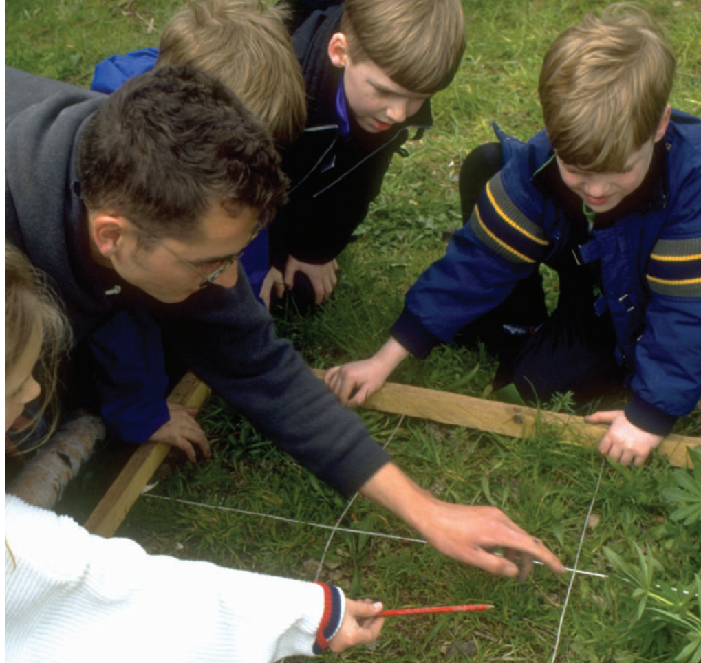
Grass roots: letting in postdocs brings UK schools extra money for science staff and equipment.

Why encourage active scientists, not just graduates, to become teachers? Sykes's